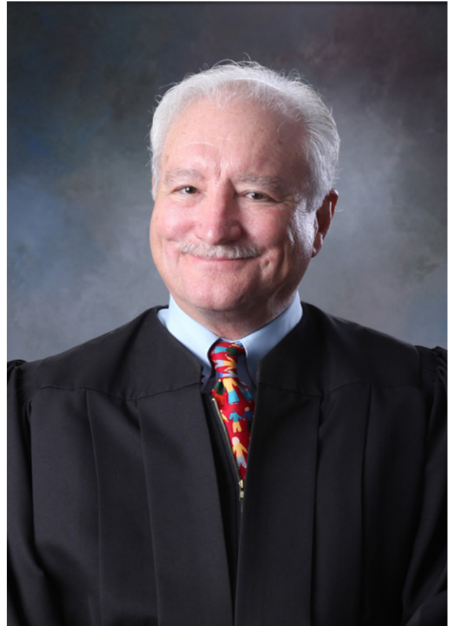
Judge Fred Mulhauser

The court school and juvenile drug treatment court programs focus on adolescent brain development and developing treatment plans that improve the youth’s functioning while addressing educational and vocational skills deficits. These plans take into account personal, emotional, and family problems.